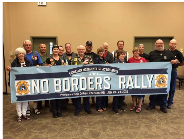
Saskatoon No Borders' Attendees