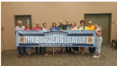
Atlantic's No Borders' Attendees