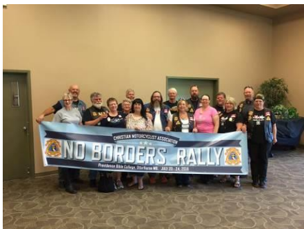
Victory Riders No Borders' Attendees

God has so much love that He shares it with each of us. The blessings that God gives when His people believe in Him, love Him, and step in faith with Him, cannot be contained to one being. The love God flows through me, through my husband, through fellow believers, shines and that is what God wants. Be faithful. Be strong, Be willing to say to God as in Isaiah 6:8, “Here am I. Send me!” Claim God’s love and come home.