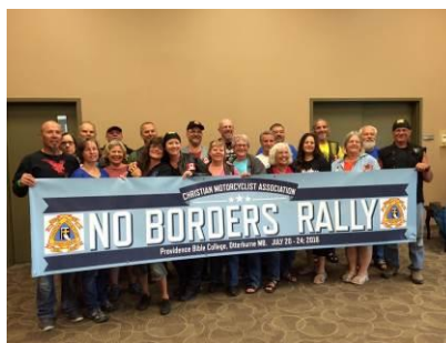
Alberta No Borders' Attendees