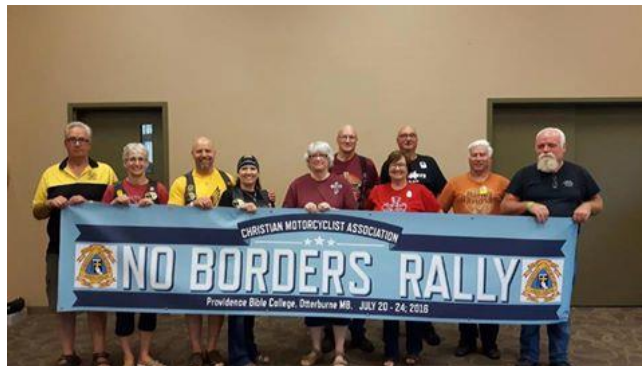
Mamitoba NO Borders Attendees

This rally was the best we have ever attended. The facility was fabulous. The speakers were all very interesting and all brought forth a thought provoking message. The praise and worship team worked well together and so the music was very good. The foyer was large enough and very comfortable to facilitate visiting and fellowship beyond the sessions. With almost everyone on the grounds either in the dorms or camping there was such a feeling of unity. The taste and selection of food was top rate.